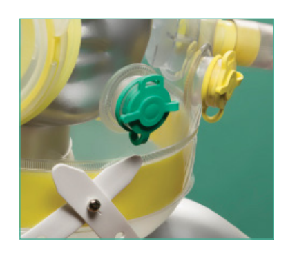
Critical Care • Non-invasive ventilation • STARMEd