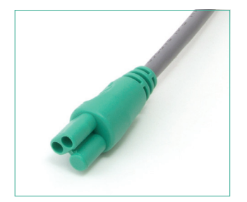
Critical Care • Humidification Accessories