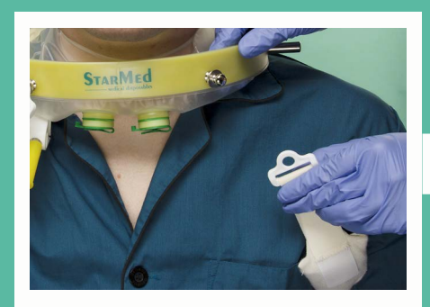
9. Raise the patients arms to ensure that the straps are tucked well under for strap sizing.