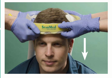
8. Put the lower part of the hood on.