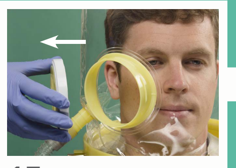
17. Open the clamp to allow the internal pressure to deflate the cushion and remove the access port cap.