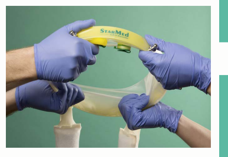
7. Two people firmly open the collar using their finger tips and thumbs along the rigid ring so that the patient's head can pass through.