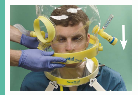
13. Attach the upper part of the hood to the lower ring.