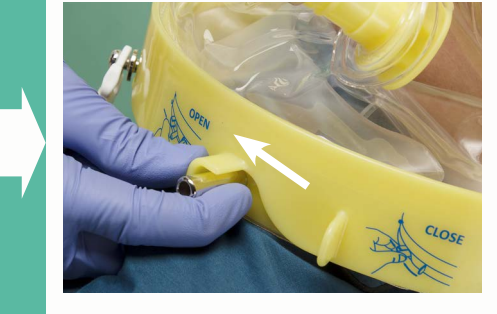
14. Lock into place using the levers.